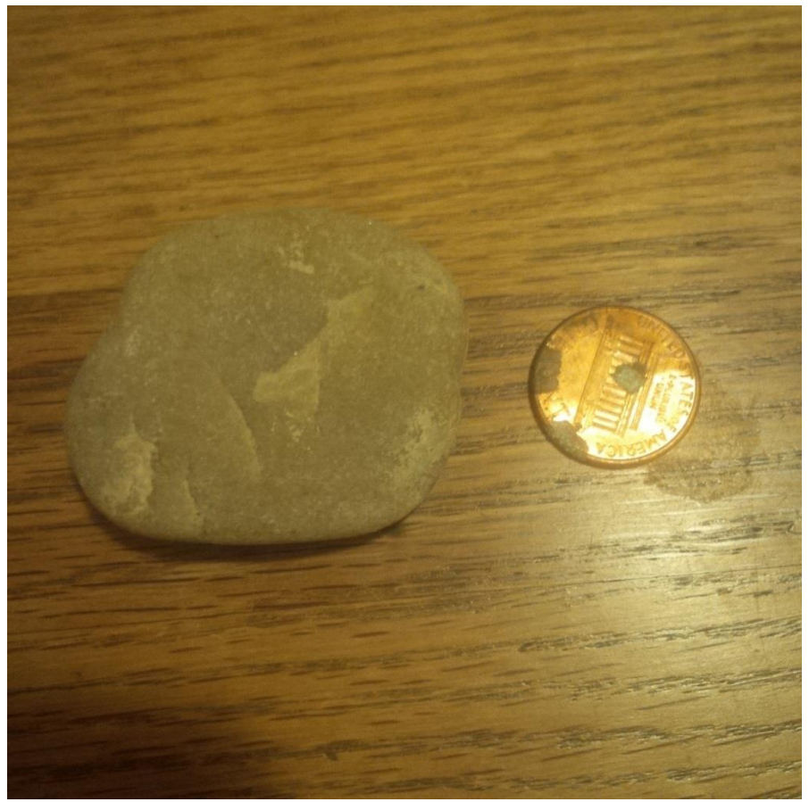
Photo 1- Sample of rounded rock taken from pile at base of crack in the west sidewall of the East Culvert. This is presumed to be original backfill material.

GSL East Culvert Memo 16 October 2013 Page 6 of 6