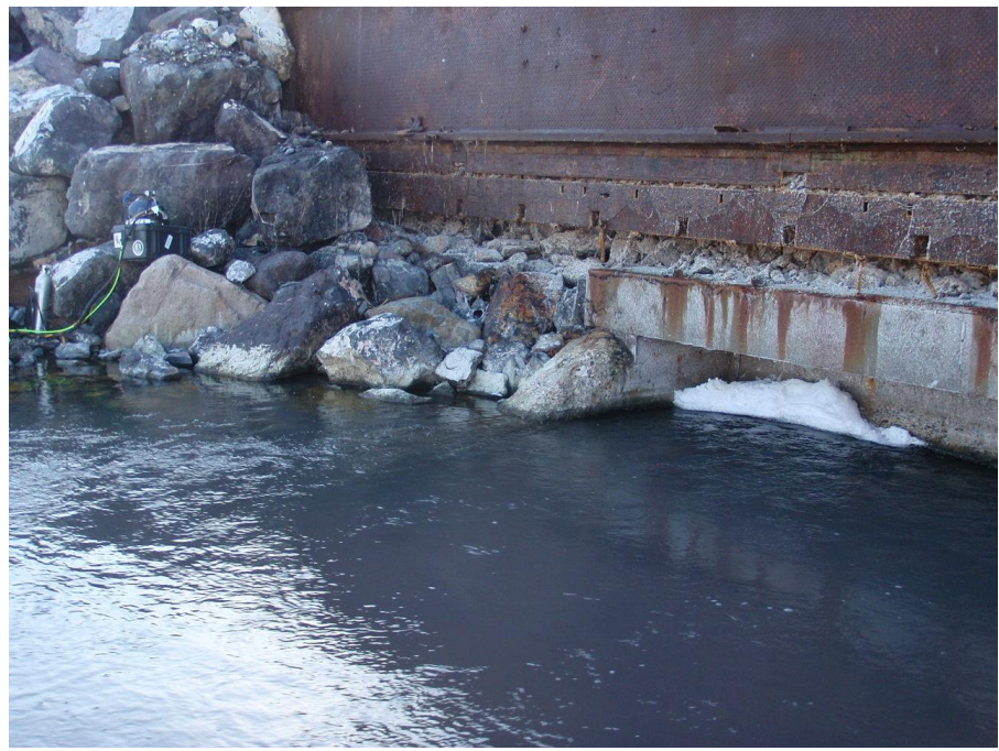
Photo 2-View of North Side of East Culvert. The water level is approximately 1.5 to 2 feet lower than in March 2013

Photo 1- Sample of rounded rock taken from pile at base of crack in the west sidewall of the East Culvert. This is presumed to be original backfill material.